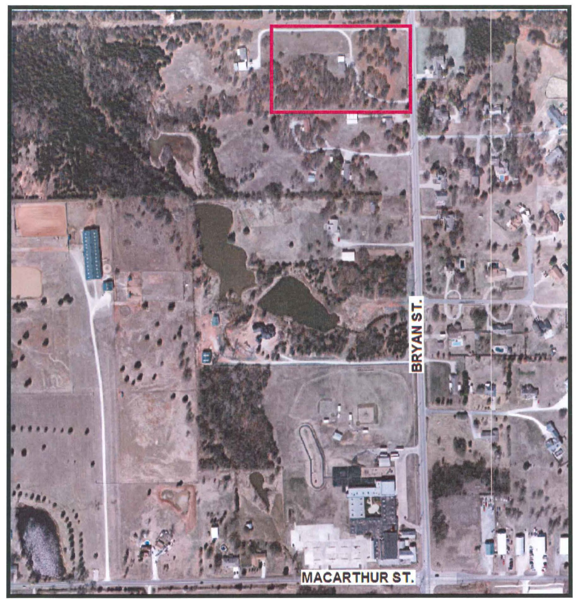
Figure 2: Aerial view of the site – approximate total area outlined in red.